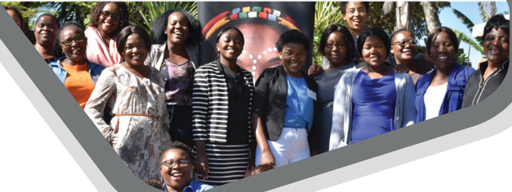
Women from Malawi, Namibia, Zambia and Zimbabwe who participated in the Stawisha leadership process.

Finding balance between the work, family and personal spheres is a struggle for most. Knowing when to step aside, ask for help and let someone else step in is particularly difficult for women. Females have to perform well and continue to prove themselves worthy of the positions they hold, be good mothers and wives at home, as well as keep a cool, calm and collected demeanor through it all. The Stawisha Approach empowers participants to pay attention to issues of wellness, which are critical if women are to succeed and lead effectively.