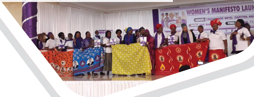
Women from various political parties at the Manifesto Launch, Malawi.

Hivos described the manifesto as a tool that cuts across religious, political, social boundaries which could be attested as women from different political parties, clothed in party attire could be seen embracing.