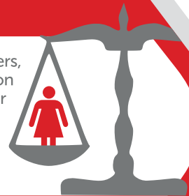
LADE's launch of electoral monitoring report, Lebanon.

Panelists during the launch urged researchers, policy-makers, politicians, civil servants and others to link the status of female political participation to the political and legal infrastructure of the country. The discussion also called for the re-evaluation of the approach towards female empowerment in the country, highlighting the need to identify the structural preconditions that hinder or help women in leadership positions and to resist the separation of feminist causes from political causes.