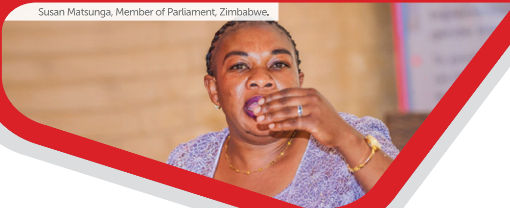
Susan Matsunga, Member of Parliament, Zimbabwe.

Matsunga is one of the female legislators that created a name for themselves in the 8th Parliament, during the 2013-2018 period by effective participation in parliament. Following the trainings, she grew confident, stood firm and made her tenure in the 8th Parliament memorable, refusing to be intimidated by the overwhelming male presence. "I encourage my fellows not to shun politics. These are the platforms of impact and influence to shape destinies of people and the nation. Women should not only relegate themselves to housewife, but seek to express their goals and dreams in politics freely. I urge women to be brave and join politics," Matsunga said.