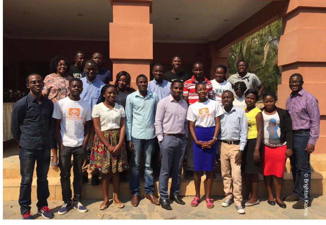
↑ Youth prototype meeting

By participating in the Zambia Food Change Lab, previously unconnected youth groups and individual youth leaders are now linked in a national platform called Youth for Sustainable Food. They work to spread the message on the importance of healthy, diverse food from healthy soils. They advocate at external events and organise their own awarenessraising activities; they are active on (social) media using podcasts and radio shows, targeting young Zambian farmers (including women and girls) to 'make farming sexy again'. They are currently expanding their scope from awareness raising to supporting start-ups in the food sector, such as looking at 'sack gardening' in local communities in Lusaka to make these populations vegetable-secure.