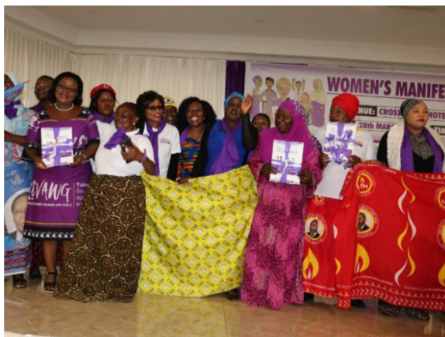
Women politicians at the launch of the Women's Manifesto

Malawi's 2019 tripartite elections saw female candidates increase their share of parliamentary seats from 16% to 23%. There was an increase of female candidates at Local Government from 11% in 2014, to 13% in 2019. Female Councillors in WE4L target areas constituted 31% of total number of female councillors elected (35 out of 110 wards