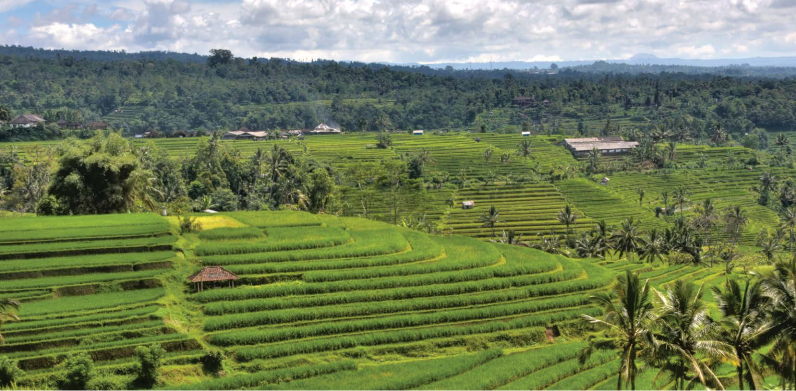
Rice terraces in Bali, Indonesia (Pondspider)