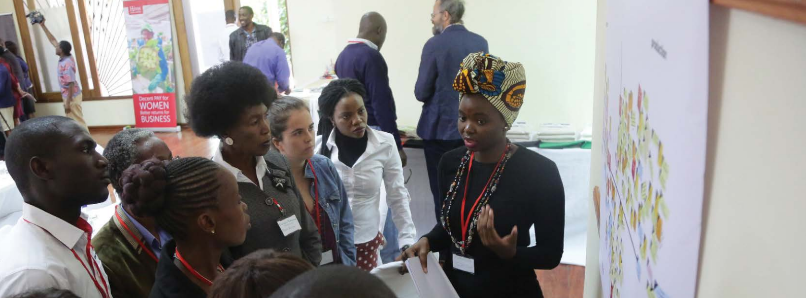
Food Change Lab in Lusaka, Zambia

Educational programmes and awareness raising are also vital to create demand for healthy foods. For instance, 45 per cent of households in Kenya that had been part of a Bioversity International initiative on the nutritional benefits of African traditional leafy vegetables reported increased