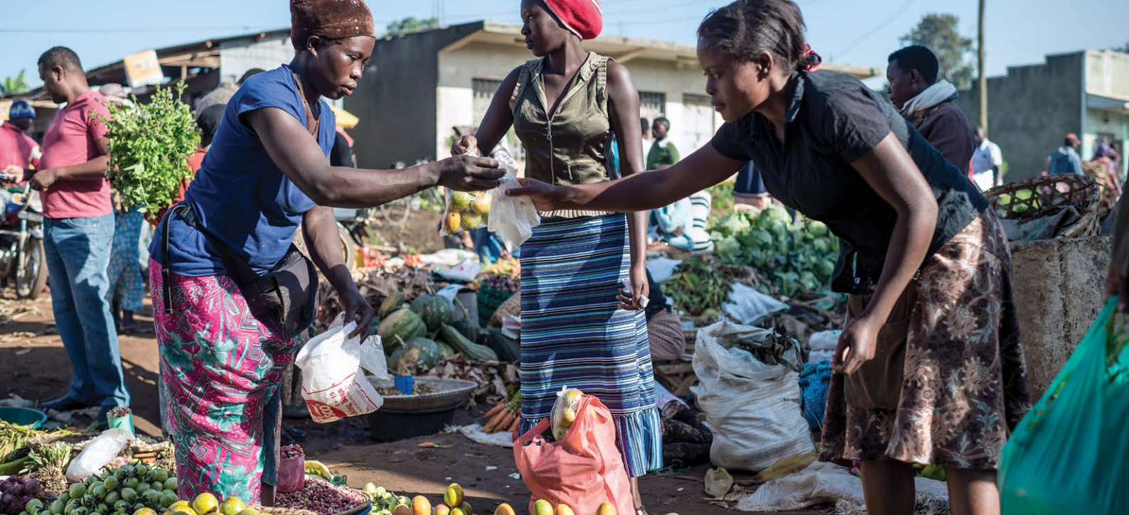
Informal food market in Uganda (Sven Torfinn)