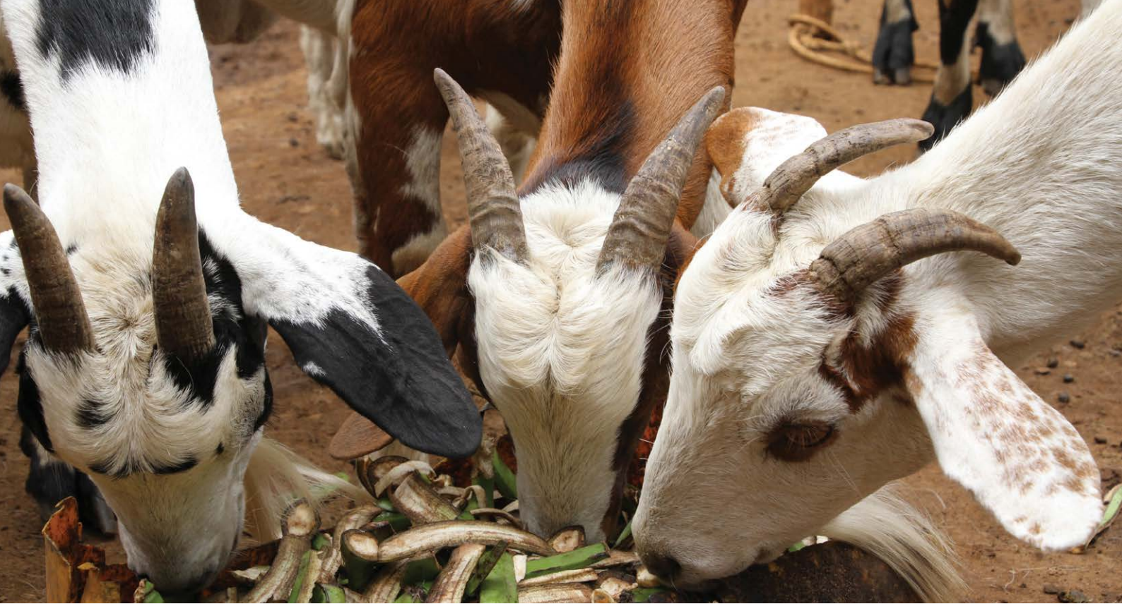
Goats on a farm in Fort Portal, Uganda (Nimrod Bagonza)

In bringing together food production and consumption, diets and health, this study takes a food systems perspective. The global food system is multifaceted, and it is essential to reorient the current focus on production towards a more holistic approach which also encompasses access, distribution and governance, consumption and waste, markets and livelihoods. Food systems thinking can highlight the connections between all of these different elements, breaking down silos in the process.