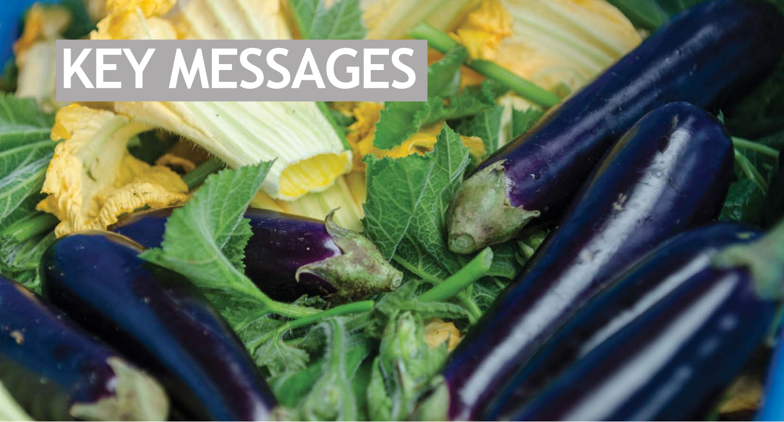
Sustainably produced vegetables (Simon Lim)