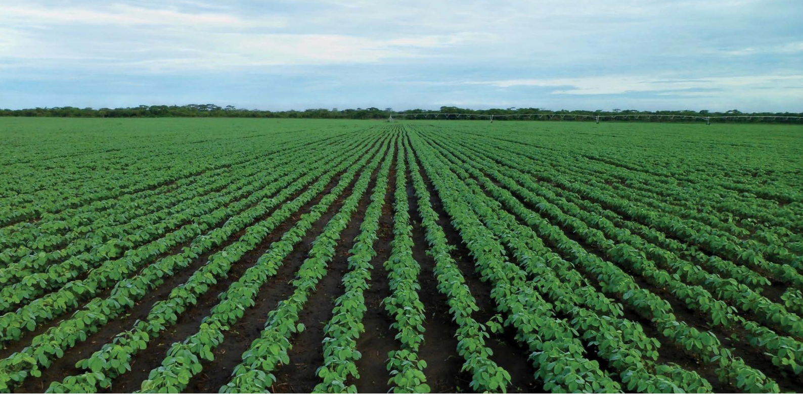
Many crops are grown in monocultures such as this soybean field

land area being planted to just two crops: winter wheat and cotton. 104 One key reason for the narrow approaches evident in agricultural policies and programmes is the way separate departments operate in their individual ‘silos’, leading to a lack of coordination and coherence among different ministries such as agriculture, environment and health.