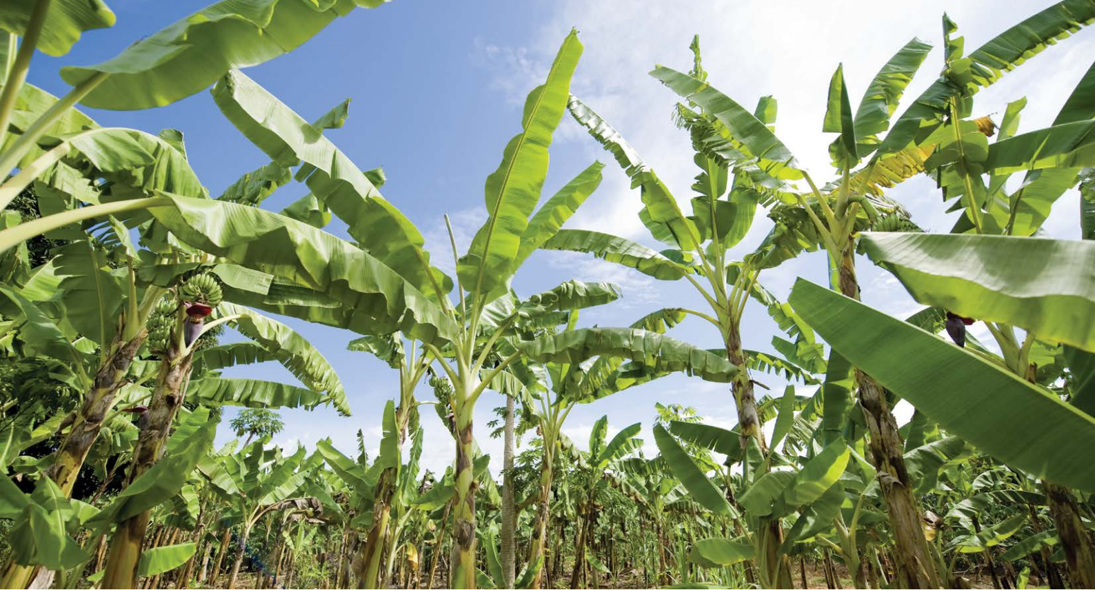
Banana plantation in Africa

material from traditional crop varieties and their wild relatives has contributed many key traits to breeding programmes for modern crops, including higher yields, pest resistance, drought tolerance, as well as adaptation to low temperatures and poor soils. 40