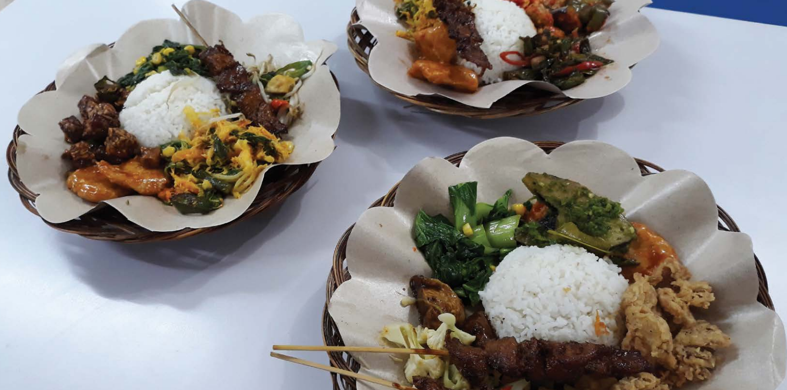
Plates from vegetarian restaurant in Bandung, Indonesia (Silvana Paath)

contents of different crops and varieties. 189 The primary metrics for evaluating the success of agricultural systems have been crop yields, economic output and cost-benefit ratios – yet these metrics do not capture the diversity of nutrients that are essential for human health. 190 The emphasis is primarily on cereals which provide energy and protein, with much less attention to fruits and vegetables, which are the richest sources of many micronutrients. 191 Even when non-staple crops are targeted for research and improvement, the focus tends to be on individual crops rather than the promotion of diverse production systems.