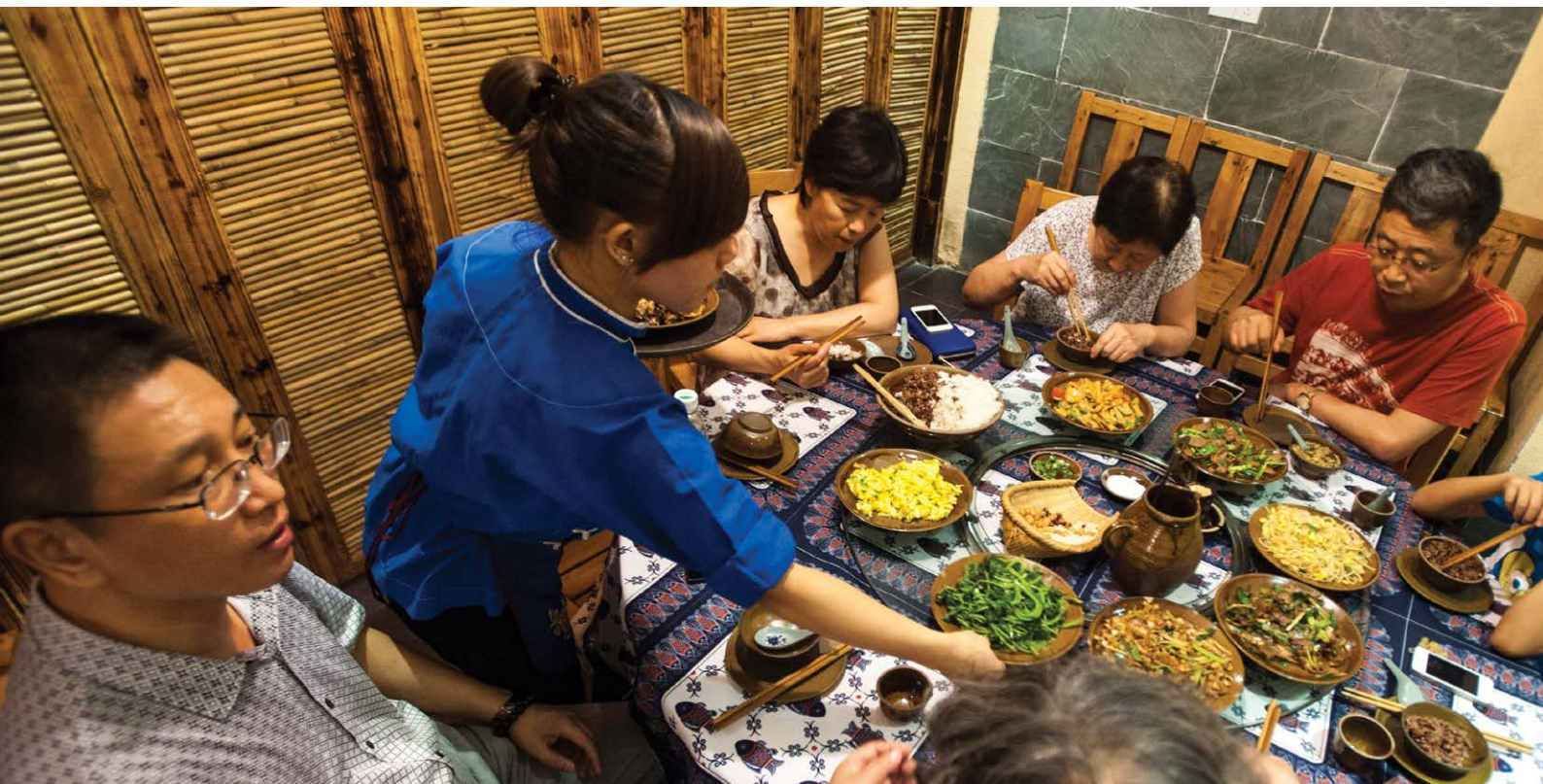
Tushengliangping farm-to-table restaurant, Guangxi province, China (Simon Lim)

and stimulating demand for diverse and healthy foods, as markets for diverse crops and animal products need to be supported and expanded. This in turn will give farmers strong incentives to practise sustainable farming methods and to conserve their traditional varieties and local animal breeds, as will reforming intellectual property rights regimes to protect the rights of farmers as well as breeders. Meanwhile, policies, subsidies, research and extension programmes need to be re-aligned to support diverse food production and consumption. Finally, the cultural underpinnings of diverse food systems – which are also under threat worldwide – need to be protected and strengthened. Inclusive governance models and multi-stakeholder approaches can help to achieve all of these ends, particularly when they use and build upon citizen's knowledge and practices to re-shape food systems.