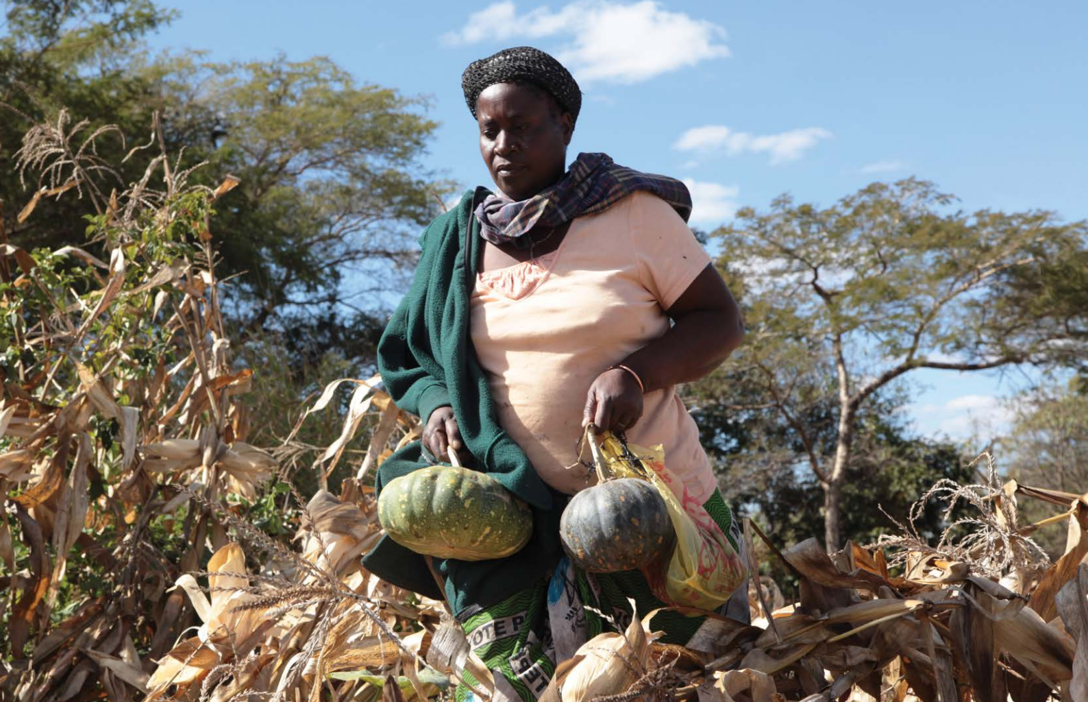
Smallholder farmer with pumpkins she harvested in her maize field in Chongwe, Zambia

Most academic studies have found a positive association at the household level between the diversity of agricultural production and dietary diversity in agricultural households, although they differ on the magnitude of the association and the role of the market. 214 For instance, a review of 15 empirical studies in low- and middle-income countries analysed the relationship between agricultural biodiversity and market access and the diversity and quality of diets in agricultural households. 215 It found that agricultural biodiversity at the household level is positively associated with dietary diversity or dietary quality of both individuals and households in 14 out of 15 studies, irrespective of wealth or market access.