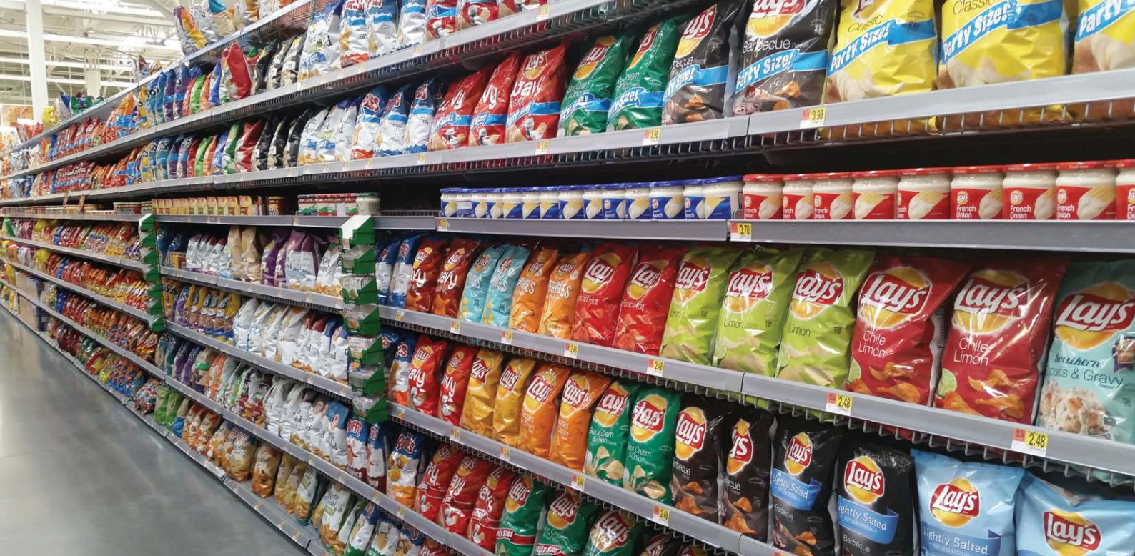
Supermarket aisle with ultra-processed foods