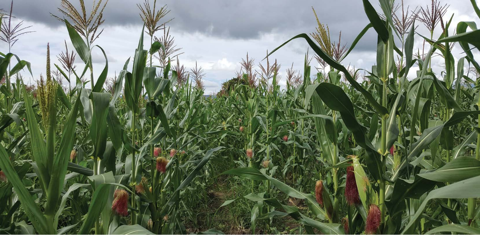
Maize field in Zambia

pulses are richer in nutrients than the high-yielding varieties of rice and maize that replaced them. 185, 186