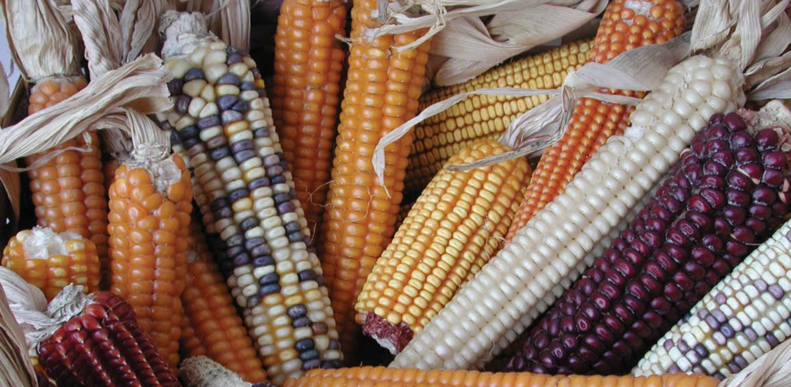
Diverse maize varieties (Serena Mlano for Slow Food)

Risk mitigation is particularly important in the face of climate change. Climate change already poses a major challenge to agriculture and this trend is likely to accelerate in the coming decades. 64 It is expected to cause significant reductions in crop yields – up to 30 per cent for maize in southern Africa and up to 10 per cent for staples such as rice in South Asia by 2030. 65 In this context, future food security depends upon the ability of agriculture to adapt to climatic change. Crop and varietal diversity has a critical role to play as it can make agroecosystems more resilient, providing resilient germplasm and options for future adaptation. 66 Equally important for adaptation is maintaining the local knowledge and practices associated with this diversity. 67