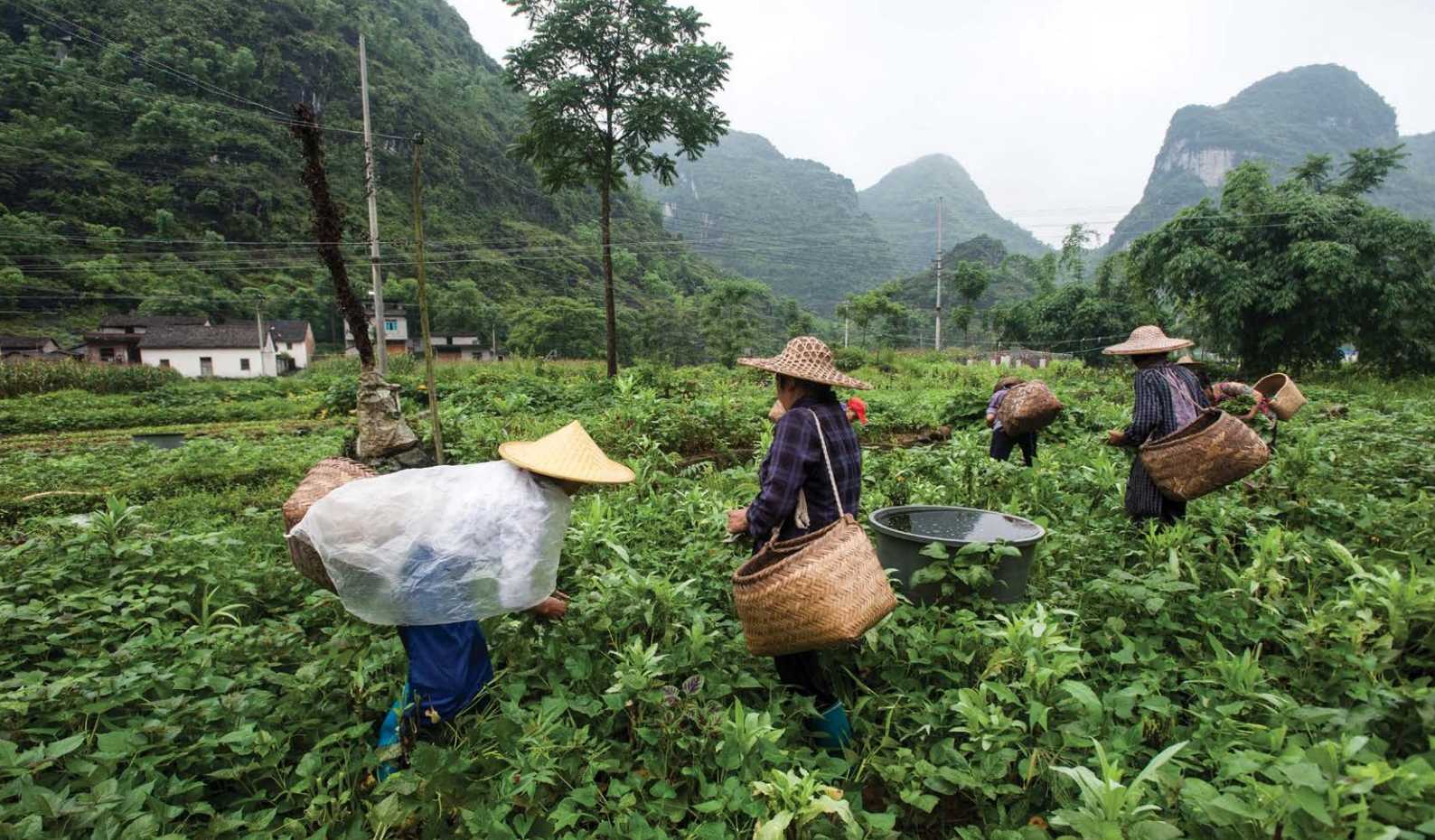
Harvesting vegetables in Shanggula village, Guangxi province, China (Simon Lim)

Seeds are fundamental to the future of food. However, current seed laws privilege the rights of corporations, plant breeders and researchers over farmers. At a minimum, laws, policies and intellectual property rights regimes must not impede farmers' ability to save, re-use, exchange and improve their seeds. At the same time, there is an urgent need to safeguard community seed systems, which can prevent loss of local crop diversity, ensure that farmers have access to seeds, contribute to recovery from droughts and other climatic disasters and facilitate seed exchange between communities, as well as between farmers and gene banks.