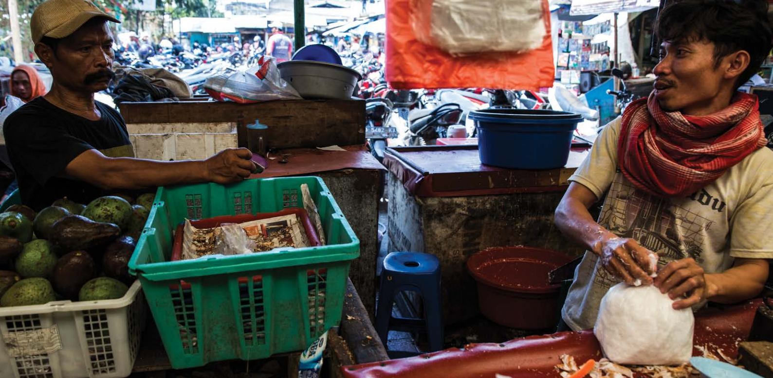
Informal food vendors in Bandung, Indonesia